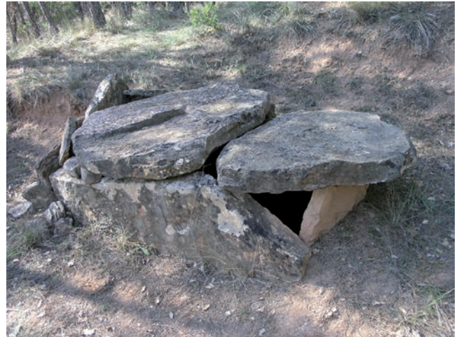
FIGURE 3: Neolithic cist from the Solsonian in La Costa des Garrics del Caballol-II (Pinell del Solsonès).

This is the period of underground cists without a mound (or semi-underground with simple mounds) in the Solsonès (4000-3400 BC, Solsonian group from the full middle Neolithic) and its neighbouring regions (Andorra, Alt Urgell, Segarra, Berguedà, Bages, Moianès) in the central highlands and Pyrenees mountains (8 and 46). All these graves have been clearly C-14 dated (Costa dels Garrics