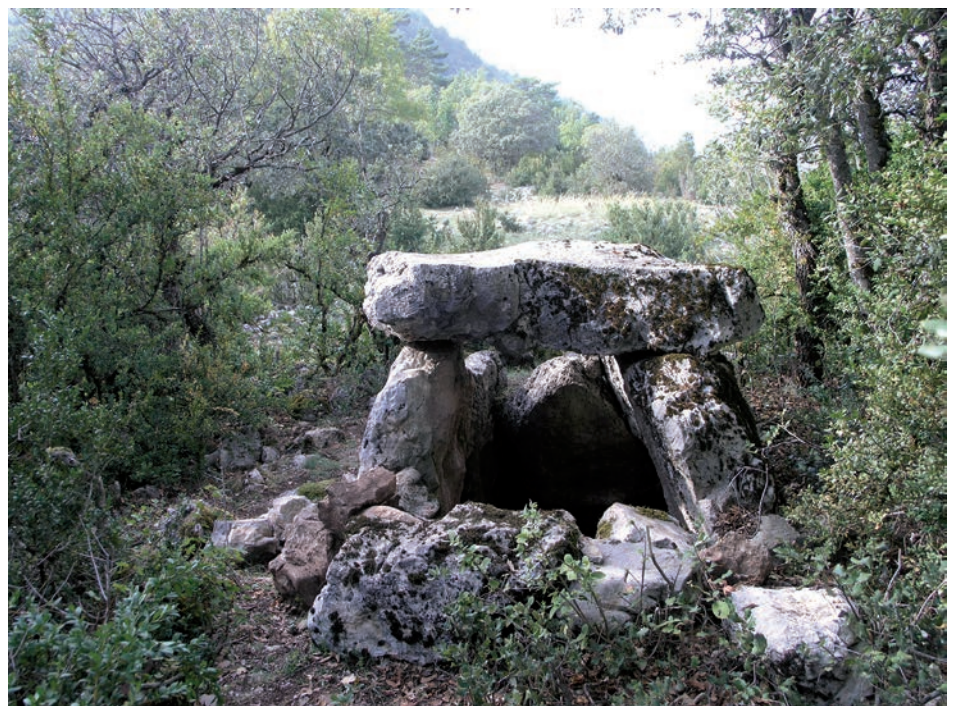
FIGURE 6: Simple dolmen with a window-door entrance in La Cabana d'en Lluís (Noves de Segre, Alt Urgell).

There are not many C-14 datings in relation to these materials from the Bell Beaker culture taken from dolmens or hypogea, but in the past decade three reliable examples were furnished based on human bones: the simple dolmen with frontal access via a window or lowered slab in Reguers de Seró (La Noguera), with exclusively Bell