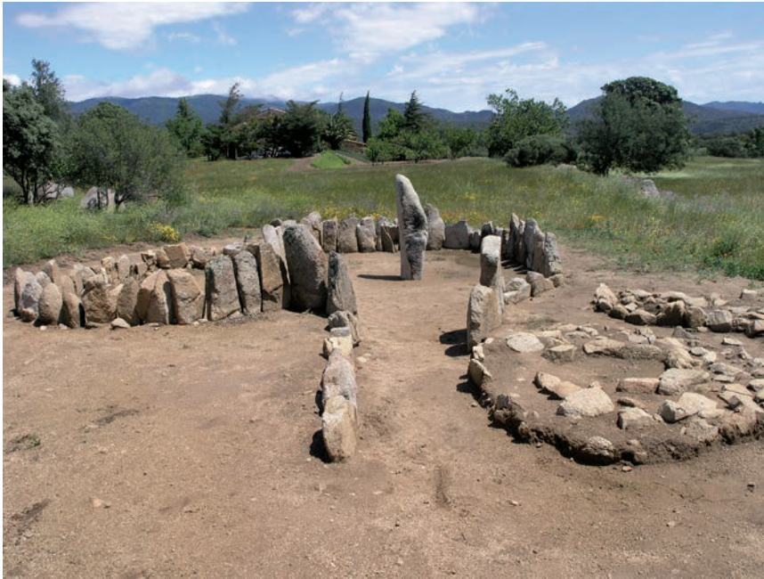
FIGURE 8: The megalithic sites in El Mas Baleta-III (La Jonquera, Alt Empordà).

Finally, we should mention the cromlech in El Pla Marsell or Pins Rosers (Llinars del Vallès, Vallès Oriental), which was discovered in 1879 by Joaquim Mercader i de Belloch and was made up of a small circle (9 m in diameter) of menhirs, most likely 12 of them originally, only 6 of which remain, with a taller menhir in the centre. This would be the first cromlech documented in Catalonia, even though it was not recognised as such until the 1990s. 85