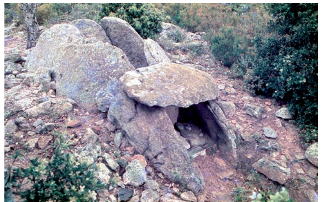
FIGURE 4: Passage grave with subcircular chamber in La Font del Roure (Espolla, Alt Empordà).