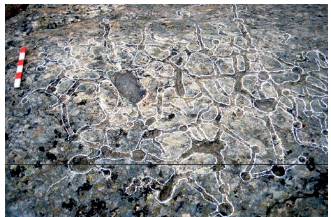
FIGURE 9: Roof with engravings (cup-marks and grooves, cross-shaped anthropomorphs) in the passage grave with a trapezoidal chamber in Mores Altes-I (Port de la Selva, Alt Empordà).

scene, one that is much richer and more advanced. 92-94 The first was the statue menhir in Ca l'Estrada (Canovelles, Granollers, Vallès Oriental) discovered in 2004 and associated with the Rouergue group (late Neolithic and early Chalcolithic) in the departments of Tarn and Aveyron in southeast France. 95 Then came the three large stelae decorated in bas-relief (chevrons and squares) which were part of the chamber in the simple dolmen in Reguers de Seró (Artesa de Segre, La Noguera) discovered in 2007. 28-30 This was followed by the six stelae with horns found in 2008 within several structures from the Veraza phase of the Neolithic settlement in La Serra du Mas Bonet (Vilafant, Alt Empordà), 96 and finally by the large anthropomorphic menhir in El Pla de les Pruneres (Mollet del Vallès) discovered in 2009, which bears a facial T with sunken eyes sculpted in bas-relief on the front with different schematic signs engraved on the rear (double