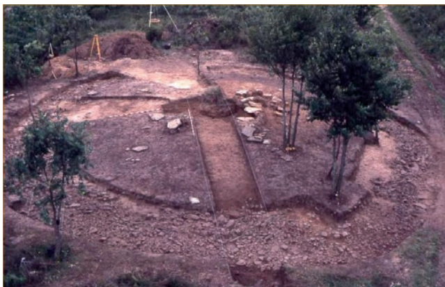
FIGURE 2: Neolithic cist with a mound in La Font de la Vena (Tavertet, Osona).

These ancient passage graves coexist with Neolithic cists with a mound in the Alt Empordà (Vinya d'en Berta, Pau; Tomba del General, Roses), whose dates are uncertain because they do not have indisputable grave goods, nor have they been C-14 dated; however, judging from their architecture, we have situated them between the full middle Neolithic and the late Neolithic (32). We should recall that there is another group of Neolithic cists with a