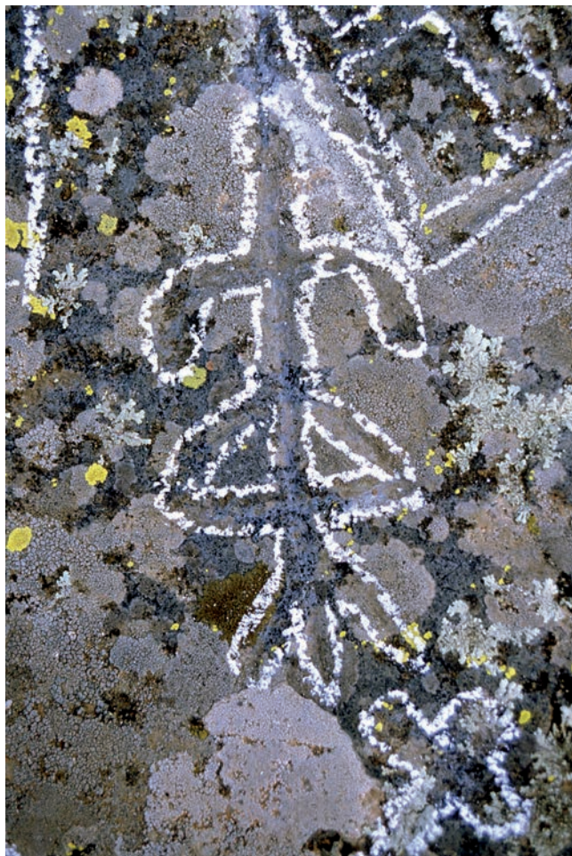
FIGURE 10: Anthropomorphic engraving on the roof of the passage grave with a trapezoidal chamber in El Barranc d'Espolla (Alt Empordà).

oval, circles, serpents), like the ones already known in the Alt Empordà-Roussillon. 97-98