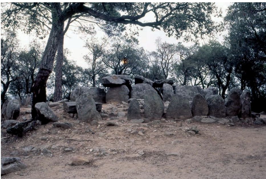
FIGURE 5: Evolved passage grave or Catalan gallery in La Cova d'en Daina (Romanyà de la Selva, Baix Empordà).

These Catalan galleries, with V- or U-shaped layouts, are the great megaliths characteristic of the Baix Empordà and the entire Catalan coastline, as well as the central highlands and foothills of the Pyrenees in western Catalonia. They include Cova d'en Daina in Romanyà de la Selva and Cementiri dels Moros in Torrent, Baix Empordà; Puig ses Lloses in Folgaroles, Osona; Tomba del Moro de Llanera in Torà, Segarra; and Mas Pla de Valldossera in Querol, Alt Camp. They are found in northern Catalonia as well, where they are the large megalithic monuments of those regions, including Na Cristiana in Sant Joan d'Albera, La Balma del Moro in La Roca de l'Albera and Serrat d'en Jacques-II in Sant Miquel de Llores in Roussillon; Serramitjana a Catllà and Mas Llusanès in Tarerac in El Conflent; and Molí de Vent in Bellestar de la Frontera, in La Fenolleda. 36 and 1